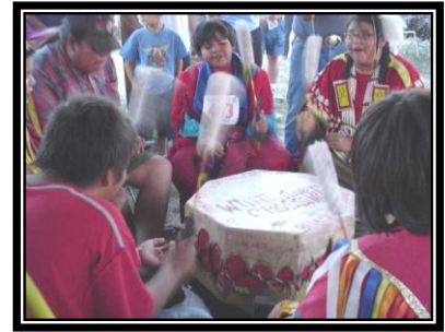
Oglala Sioux Nation Pow Wow